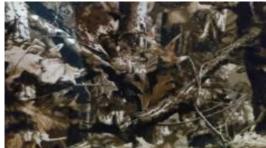
SATEEN REAL TREE